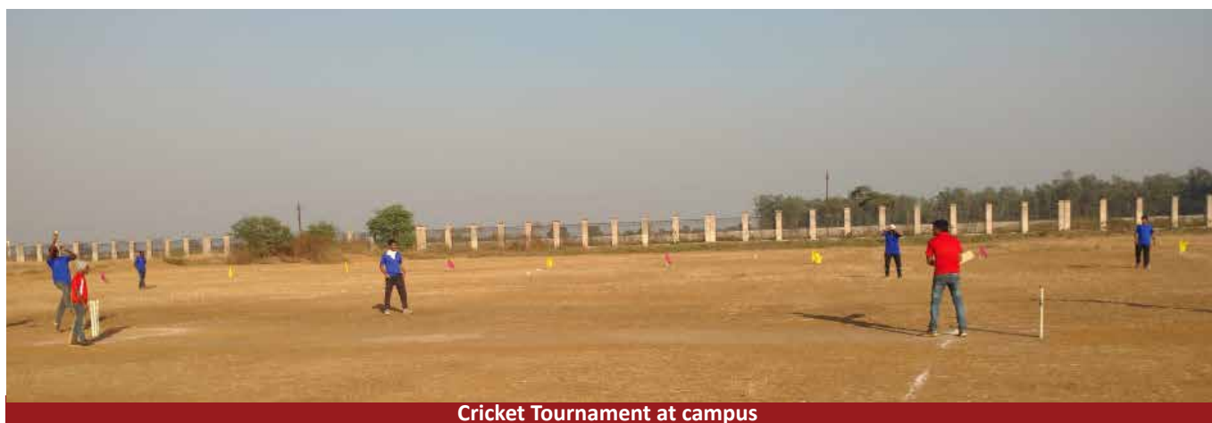
Cricket Tournament at campus