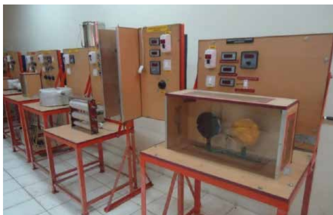
Heat and Mass Transfer Lab

The Program is exceptional blend of creativity and problem solving skill that made them capable to sustain in dynamic business environment. We believe in to learn from reflecting on experience instead from experience only. The structure of the program is not based on one size fit all approach it gives the opportunity to every student to specialize in major streams such as Human Resource, Finance, and Marketing, It & Systems, Banking, Insurance. The unparalleled and excellence teaching is a high priority and faculty members emphasize both theory and practice by using variety of technological aids. Each student completes Summer Internship Program (SIP)