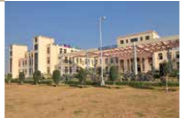
The ICFAI University, Jaipur