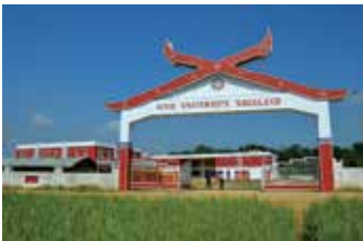
The ICFAI University, Nagaland