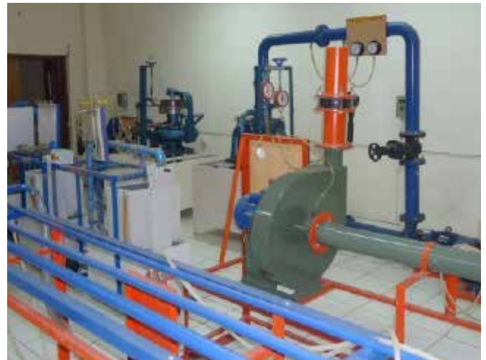
Hydraulics and Hydraulics Machines Lab

that focuses on students career choice and expand field of vision. Management theses is the unique feature of the program that lead their career forward in emerging economy and made them innovative business leaders.