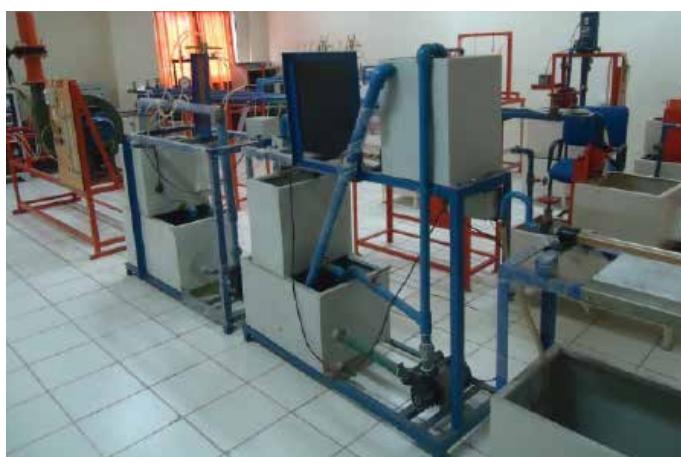
Fluid Mechanics Lab