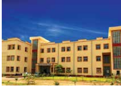
The ICFAI University, Raipur

ICFAI has established 11 Universities across India. The ICFAI Universities are located at Hyderabad [The ICFAI Foundation for Higher Education (IFHE), which is a Deemed University], Dehradun, Himachal Pradesh (Baddi), Jaipur, Jharkhand, Meghalaya, Mizoram, Nagaland, Raipur, Sikkim and Tripura.