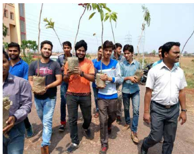
Students heading for Tree Plantation in University Campus lead By Faculty Members

Meeting of Governing Body and Board of Management The 15 th , 16 th , & 17 th meetings of Governing Body were held on July 26, 2016, September 26, 2016, and December 20, 2016. The 27 th , 28 th , 29 th , 30 th , 31 st , and 32 nd Board of Management meetings were held on February 25, 2016, May 26, 2016, June 30, 2016, September 13, 2016, November 24, 2016 and December 22, 2016.