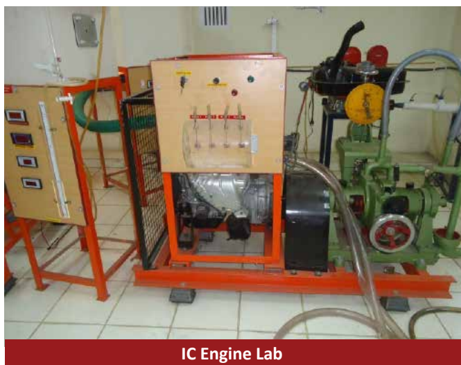
IC Engine Lab

A detailed, branch wise list of laboratory equipment currently available is given below: