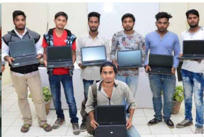
Students with Laptops