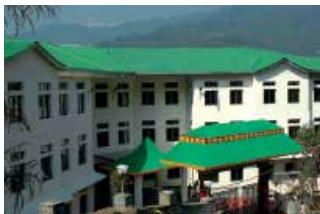
The ICFAI University, Sikkim