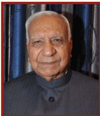
Shri Balramji Das Tandon Hon'ble Governor of Chhattisgarh