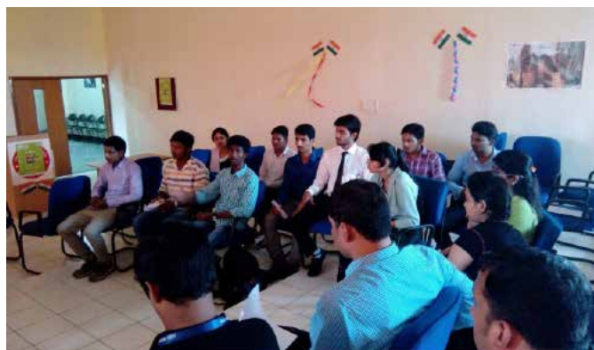
Students participating in Group Discussion

Admission Criteria: The admission committee selects every applicants by their intellectual capacity, personal characteristics, leadership potential. The admission committee evaluates students strictly on merit basis.