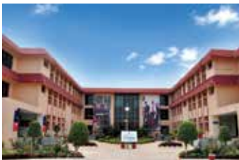
The ICFAI University, Dehradun