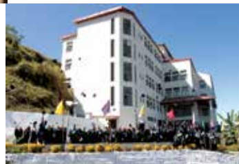
The ICFAI University, Mizoram