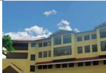
The ICFAI University, Meghalaya