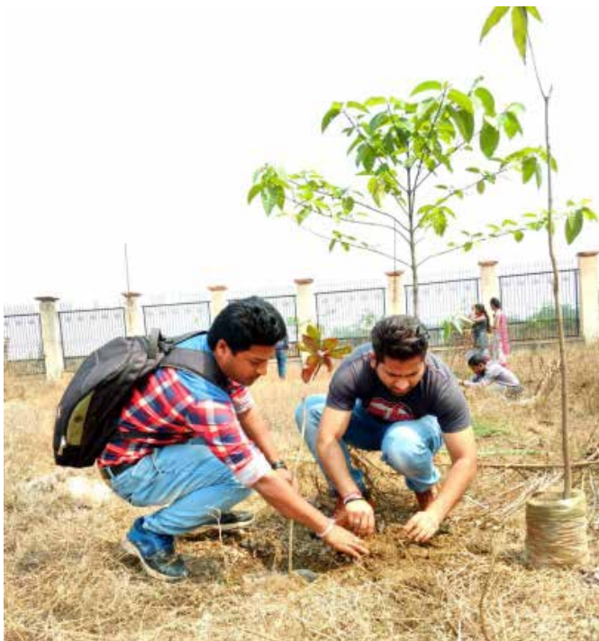
Students planting a sapling in the campus

core elements of methodology like pair work, group work, stimulating group discussions, mock interviews, skits, role plays, etc., instill confidence in the students to meet the challenges of corporate work culture.