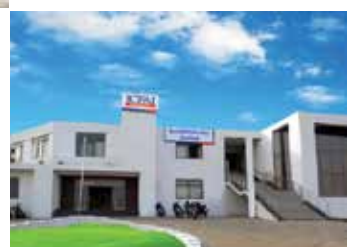
The ICFAI University, Jharkhand