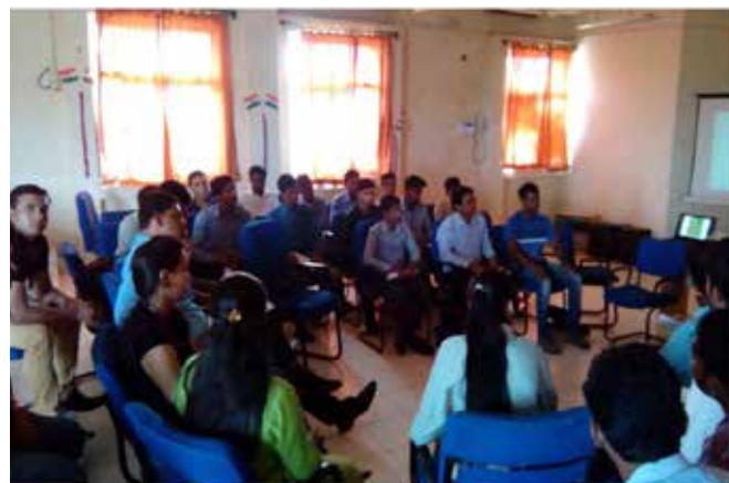
Students Participating in Group Discussion during Campus Drive

An open campus drive for graduate students from Axis Bank was conducted on 17 th September 2016 at the University Campus. Many candidates from different locations visited the University campus on that day and attended the interview.