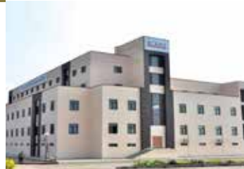
The ICFAI University, Himachal Pradesh (Baddi)