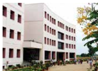
The ICFAI University, Tripura