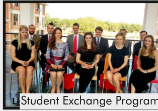
Student Exchange Program