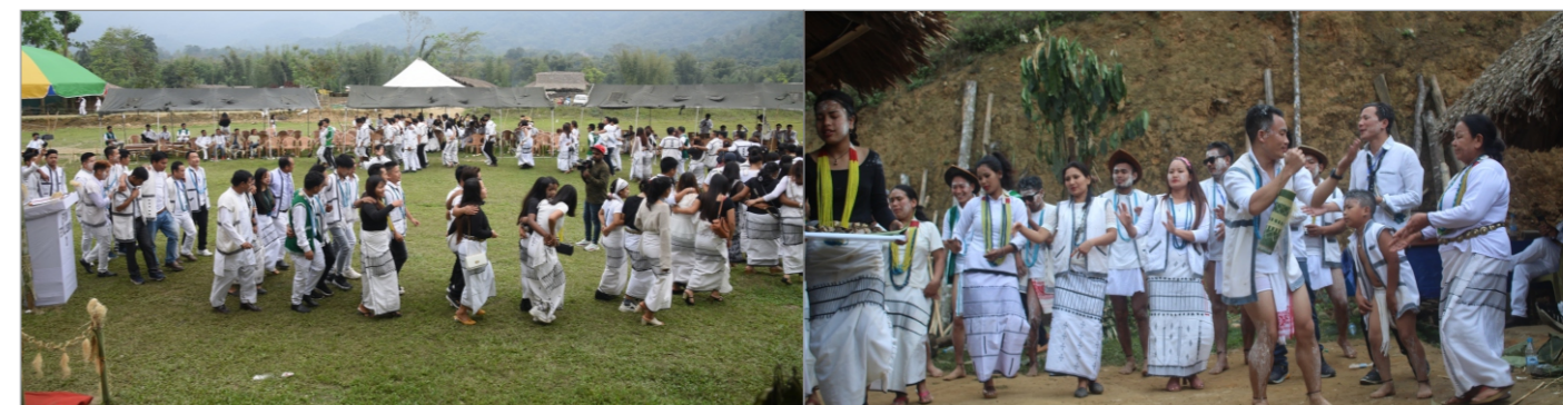
Traditional Mopin dance (POPIR)