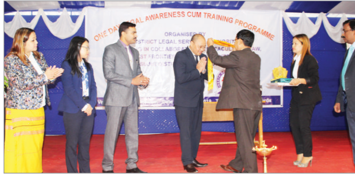
VC felicitating the resource persons inaugurated by (Legal Aid cum Training Programme)

On Civil and Criminal Procedure in collaboration with District Legal Service Authority, West Siang, Arunachal Pradesh on 2nd March 2019. The first issue of Wall Magazine of Faculty of Law was also inaugurated. On the very day a Legal Literacy Club was set up under the supervision of the District Legal Service Authority, West Siang, Arunachal Pradesh in the Faculty of Law, North East Frontier Technical University. Faculty of Law conducted a National Lok Adalat visit in the West Siang District Court at Aalo as a part of the practical course curriculum.