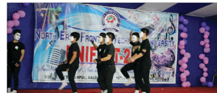
Participants of the Skit Competition during Unifest-19