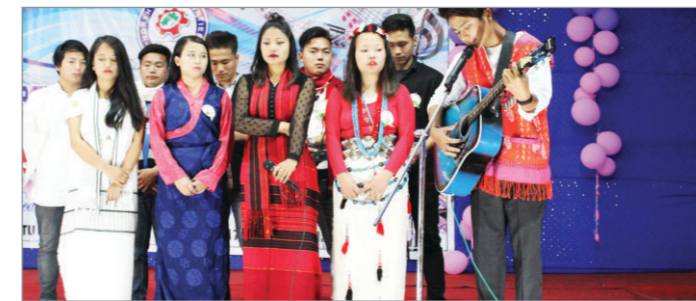
Students participating in Group Song Competition