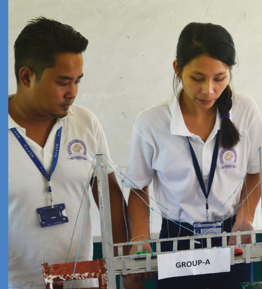
Engineering students in the Bridge Model Making Competition held on Engineers' Day .

To build up highly qualified engineering, scientific and technical personnel, who can develop innovative solutions to meet the needs of 21st century, with emphasis on employability skills