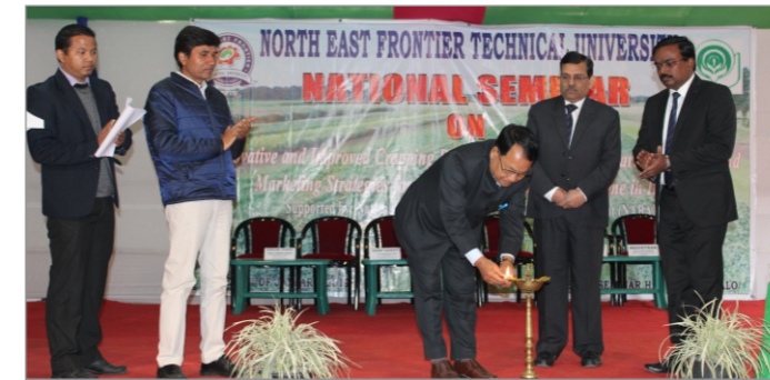
VC lights the lamp during National Seminar