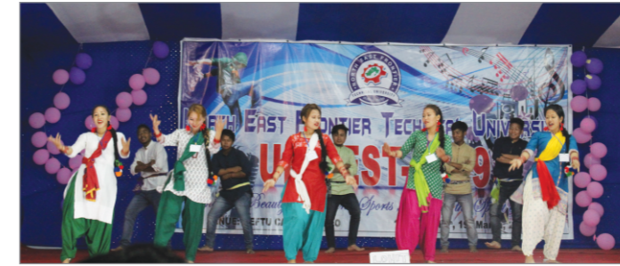
Students performing to Bollywood number in the Unifest-19