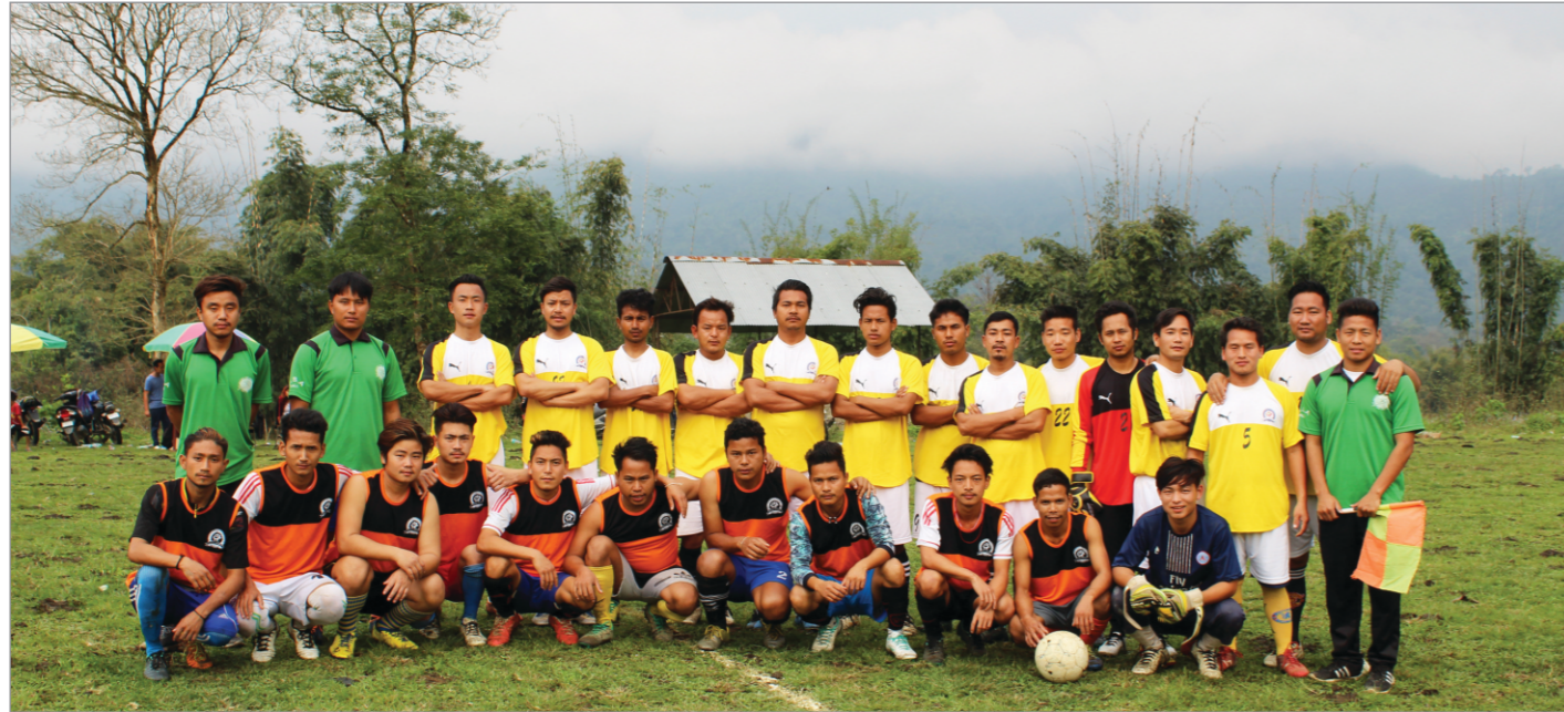
Football Team (Finalist)