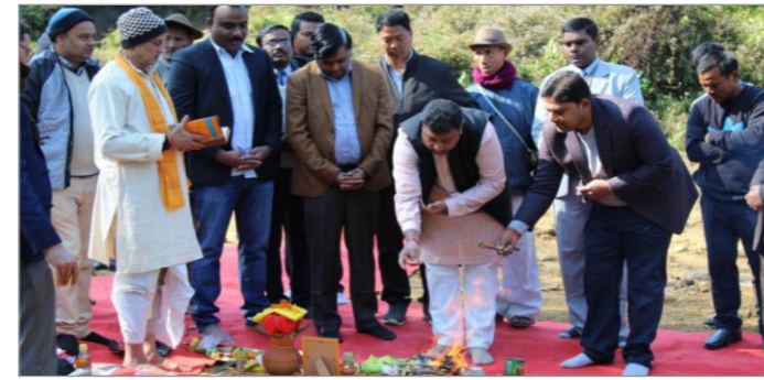
Bhoomi Pujan NEFTU New Campus

On 23 January 2019 foundation laid for second campus at Darka. Bhoomi Poojan and Kalash Sthapan was performed.