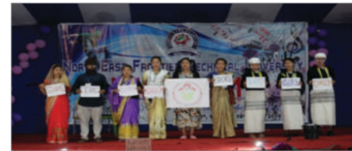
Participants of Skit Competition