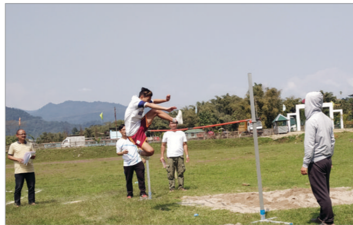
A participant of High jump Competition