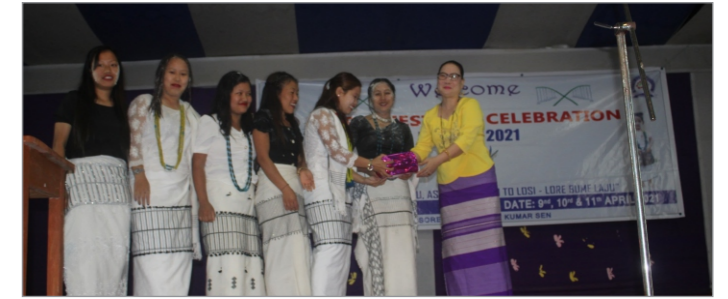
Winner of Traditional Group Dance Competition