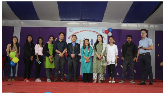
International womens' Day observed at NEFTU