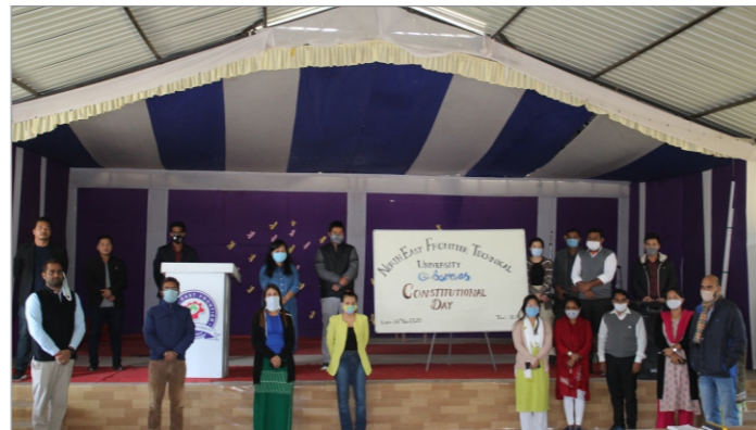
Constitution Day observed at NEFTU