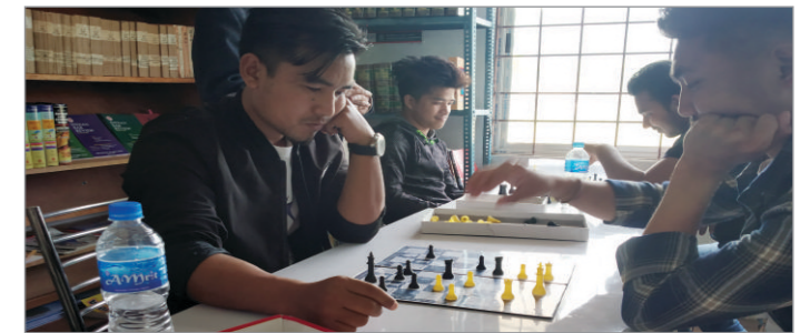
Participants of the Mind Game "CHESS"