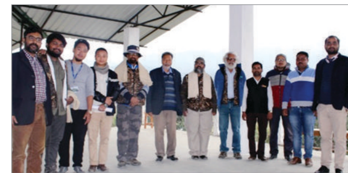
NEFTU Faculty and students with the ECG

On 25th February 2019, NEFTU held an awareness camp on the need for protection and conservation of the endangered species. The dignitaries belonged to Environment Conservation Group (ECG) who started on 100-day Great Indian Bird Expedition from Coimbatore.