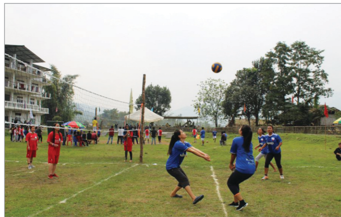
Women Volleyball team in action