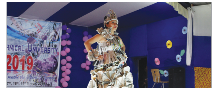
One of the Participants of "Go As You Like"