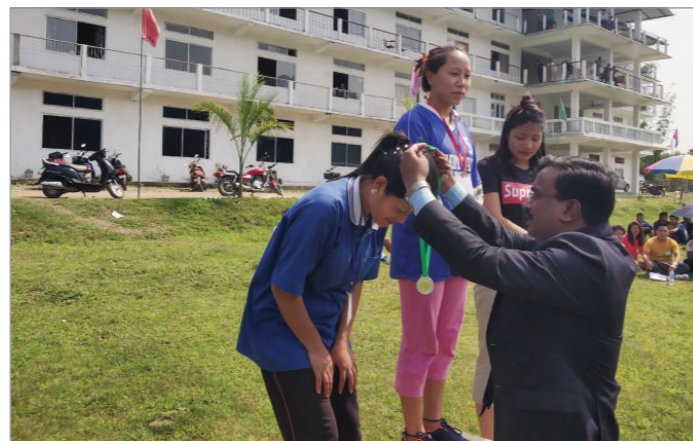
Registrar Sir giving away the prizes to Long Jump winners (Female)