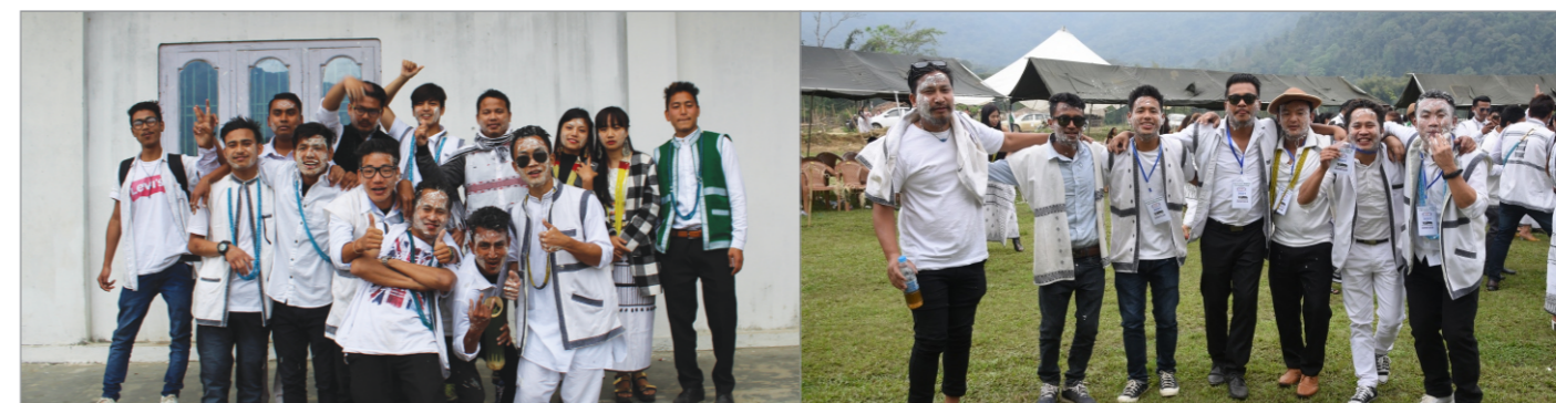
Staffs and Students enjoying the Mopin Festival