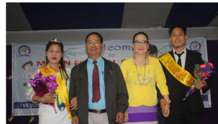
Mr. & Ms. Mopin 2021