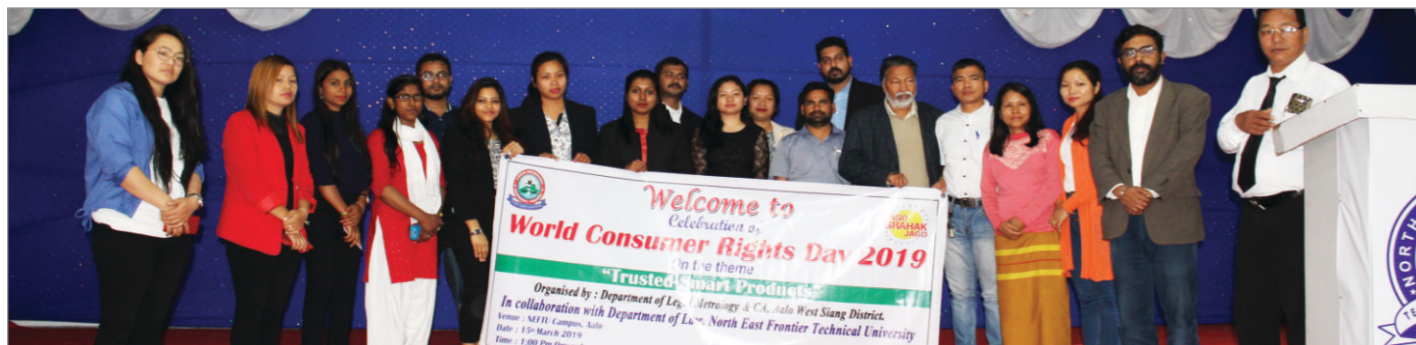
Participants of World Consumer Rights Day

On 15th March 2019, Faculty of Law in collaboration with Department of Legal Metrology and Consumer Affairs, West Siang, Government of Arunachal Pradesh observed World Consumer Rights Day.