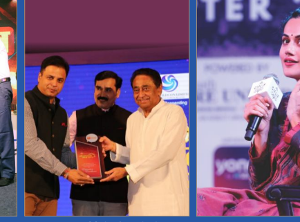
Former Chief Minister Tapsi Pannu at Campus