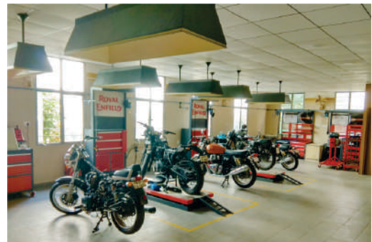
Royal Enfield Skill Development Center