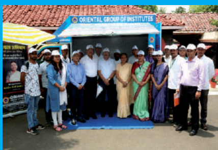
TB AWARENESS TEAM OF ORIENTAL ALONG WITH HONORABLE ANANDI BEN PATEL, GOVERNOR, U.P.