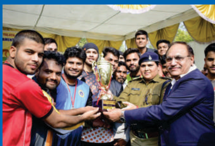
WINNERS OF RGPV STATE LEVEL CIRCLE KABADDI AT ORIENTAL CAMPUS