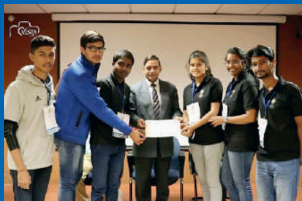
WINNERS OF SMART INDIA HACKATHON - 2019 A NATIONAL LEVEL EVENT AT NIT PATNA