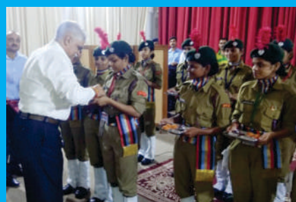
ORIENTAL NCC GIRLS CADETS CELEBRATING RAKHI AT CRPF BANGRASIA CAMPUS