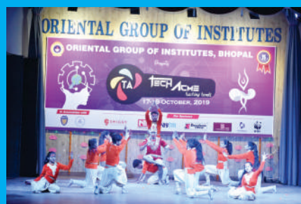
TECH ACME-2K19 INAUGURAL CEREMONY