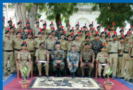
NCC CADETS ATTENDING ARMY ATTACHMENT CAMP