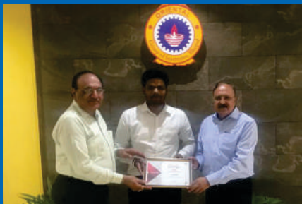
N01 & ONLY INSTITUTE IN MP WINNING NATIONAL EMPLOYABILITY AWARD 2020