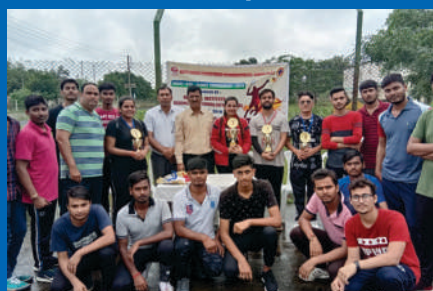
WINNERS OF RGPV LAWN TENNIS TOURNAMENT 2019