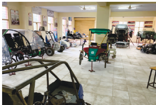
Automobile Project Lab