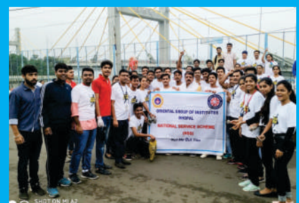
ORIENTAL NSS VOLUNTEERS PARTICIPATIONS IN SWACHH BHARAT ABHIYAN