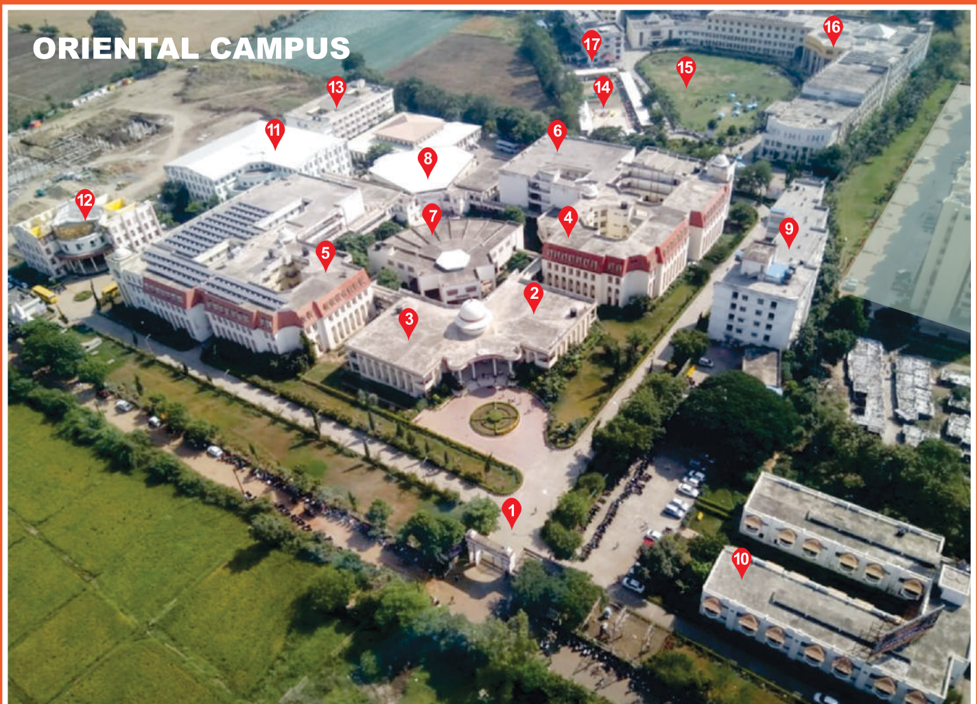
1. Entrance Gate. 2. Administration Block. 3. DELL Lab. 4, 5, 6. Oriental Institute of Science of Technology. 7. Central Library 8. Auditorium. 9, 13. Girls Hostel. 10. Guest House 11. Oriental College of Pharmacy. 12. Oriental College of Management. 14, 15. Oriental Play Ground. 16. Oriental College of Technology. 17. Boys Hostel