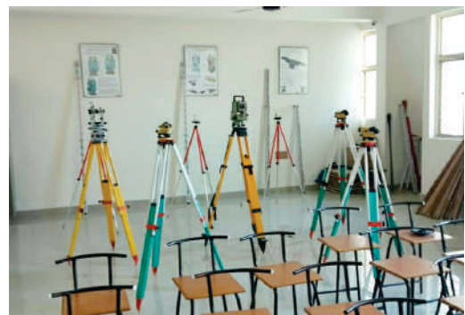
Civil - Survey Lab