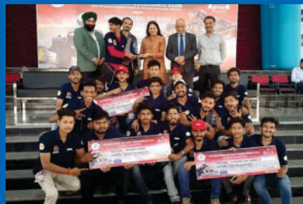
WINNERS OF GO-KART 2019 - INTERNATIONAL EVENT AT JALANDHAR, PUNJAB