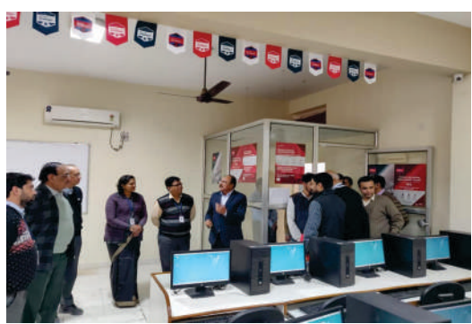
Redhat Academy Lab