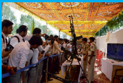
CRPF DISPLAY OF WEAPONS AT ORIENTAL CAMPUS