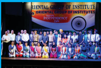
INDEPENDENCE DAY CELEBRATIONS ON CAMPUS