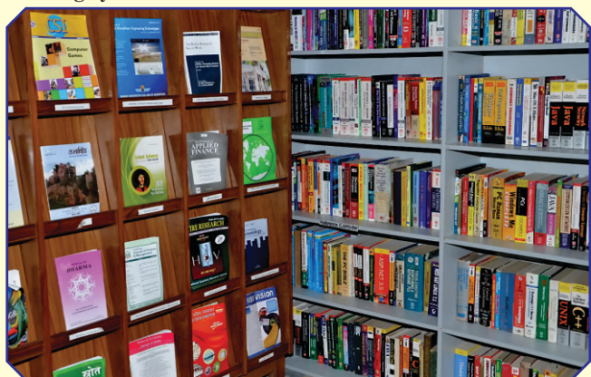
Rich Collection of Journals & Magazines