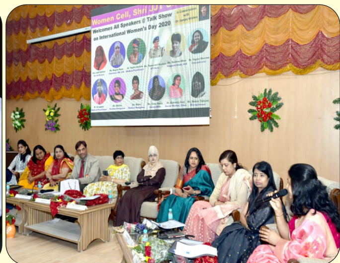
Women Cell of Shri JJT University celebrated International Women's Day by organising a Talk Show 'Roll of Women in Changing World'. On this occasion, all woman staff of SJJTU was felicitated also with 12 eminent Panelists on 8 th March, 2020.