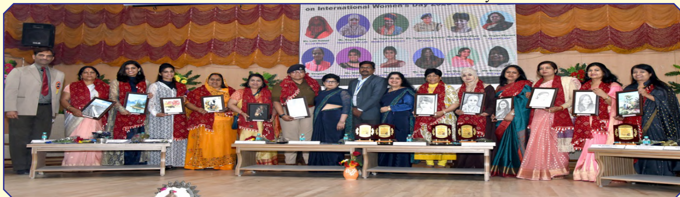
A Talk Show was organized by WDC with eminent women personalities on International Women's Day on 8 th March, 2020 @ SJJTU Auditorium.