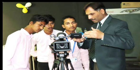
Practical Teaching in a Studio Session on TV Production