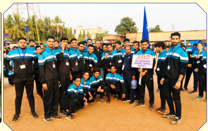
SJJTU Athletics Team participated in 80th All India Inter University Athletics Championship 2019-20 @ Mangaluru on 02-06 January, 2020