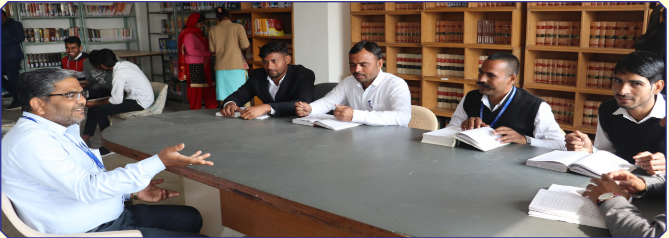
Exclusive Law Library

The Institute has well-furnished infrastructural facilities comprising Moot court hall, legal aid cell, along with an adequate library and computer facilities with internet connectivity. The institute provides the facility of regular coaching for various law-related competitive examinations (like Rajasthan judicial service, assistant public prosecutor and law officers).