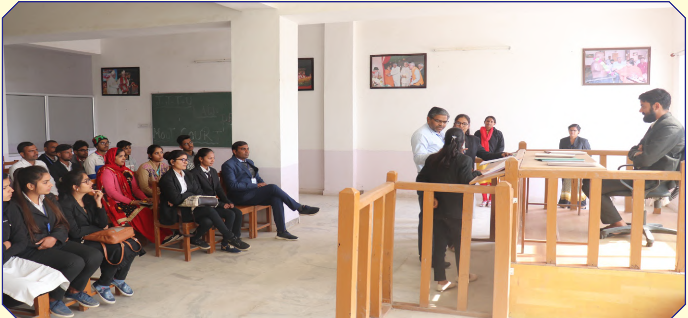
Practical Training of Moot Court Proceedings