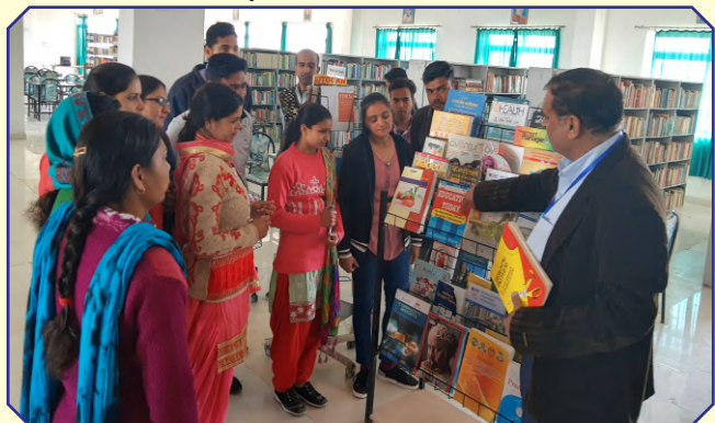
Chief Librarian guiding Students regarding Computerize Bar Coding System.