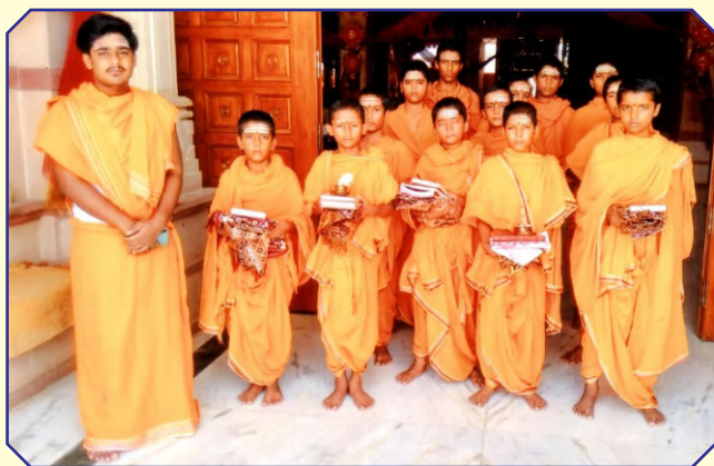
Shri Jagdishprasad Jhabarmal Tibrewala Ved Vidyalaya: a unique initiative to promote Indian Culture & Heritage run by Shri Rajasthani Seva Sangh at Khemi Shakti Mandir, Jhunjhunu .

Shri JJT University has been established with a commitment to make higher education available to all those who are deprived of object-oriented modular education with an emphasis on practical knowledge keeping in view the emerging industrial needs, business opportunities and research requirements globally in different areas of science, technology, and management.