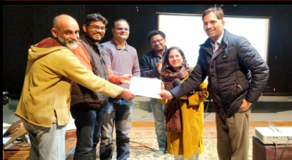
Dean, IJMC received Certificate for Workshop on Visual Story Telling conducted by FTII, Pune & JKK