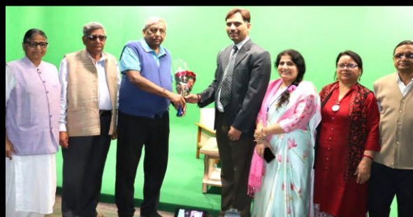
Welcome of Hon'ble Chairperson on Inaugural Function of TV Studio.

Media sector is growing swiftly day-by-day and institutions are required to keep themselves abreast with the changing dynamics, so that the knowledge can be put into practice as per the demand of the industry. Our thrust is to keep our students updated and for this purpose, we get inputs and interactions with people from different walks of the life so as to prepare industry leaders of global standard to achieve our mission.