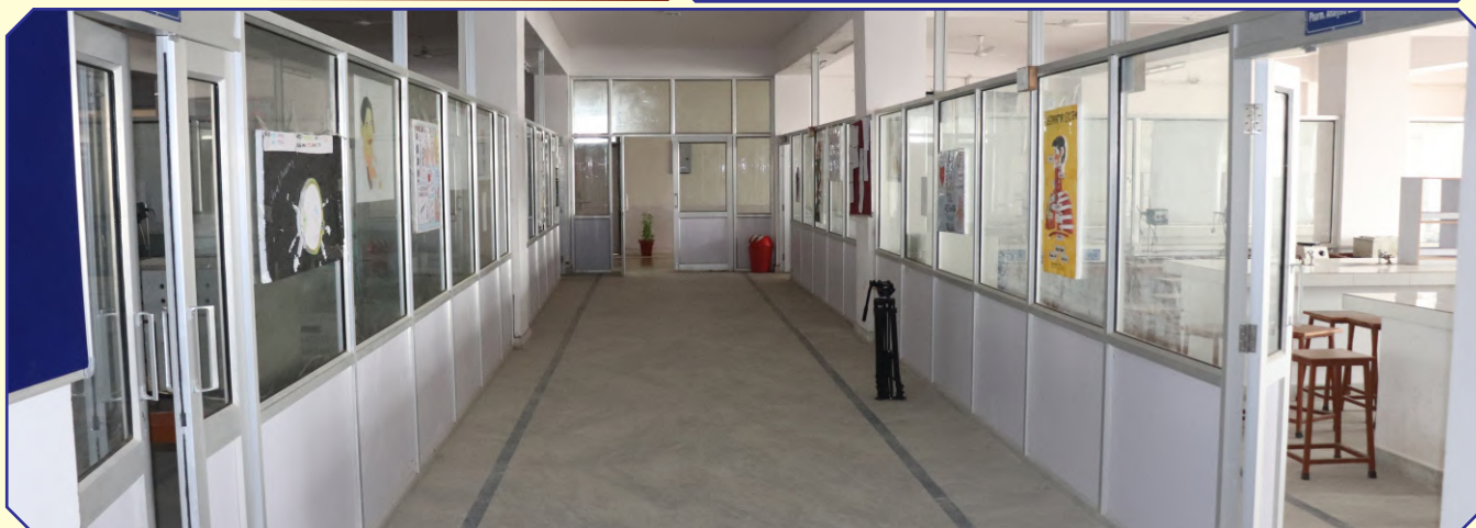
Pharmacy Lab: Equipped with Modern Instruments