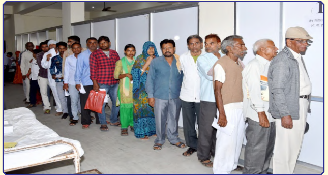
Que: Patients of Shekhawati Region waiting for Medical Consultation