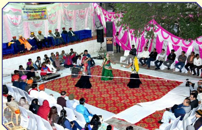
Festival of Colours Holi was celebrated by Shri JJT University for Communal Harmony in the presence of all sections of society at Tibrewala Haveli, Jhunjhunu on 29th February, 2020.