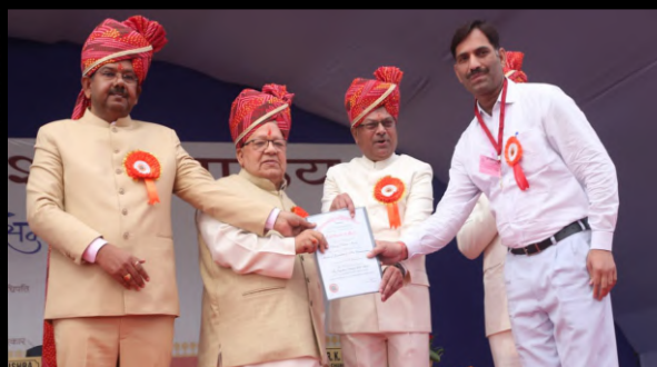
Dean, IJMC received First Gold Medal in MJMC (UOR) from Hon'ble Governor.