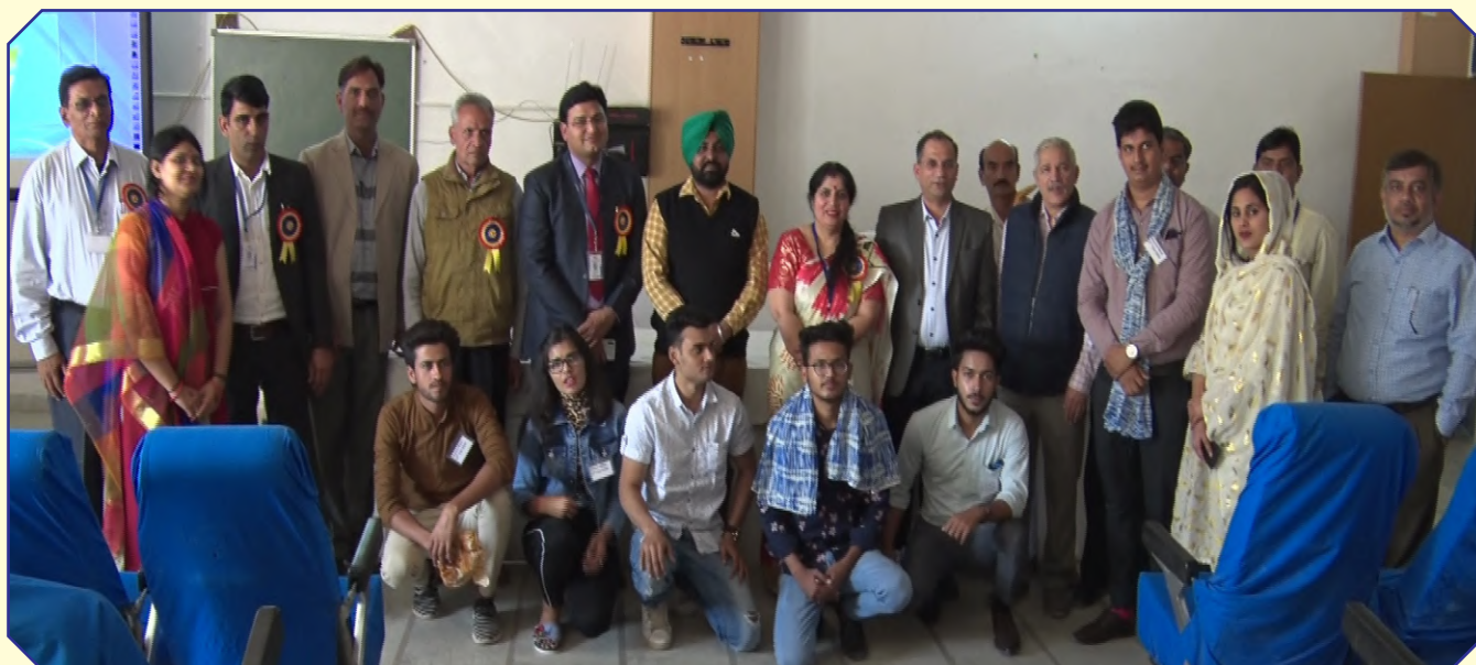
An Alumni Meet was conducted on 27 th February, 2020 @ SJJTU campus.